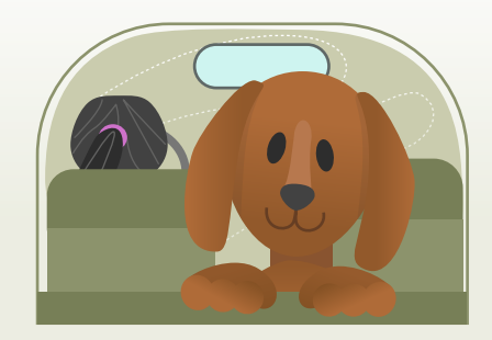
MOST PATIENTS RECOVER IN 24 HOURS TO 3 DAYS DEPENDING ON AMOUNT INGESTED.